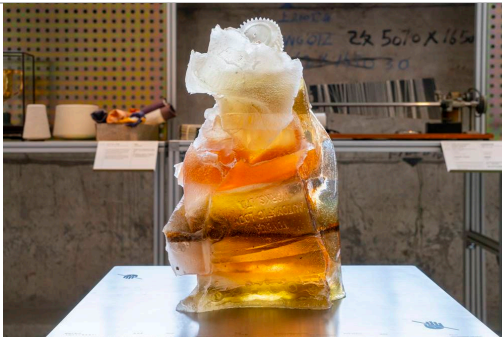
Park Jeehee, Drawing Elliptical Orbit (when the half-moon sets in late summer) , 2022