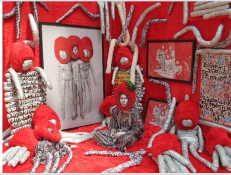
Kobayashi Yuki, Factory of Universe , 2024