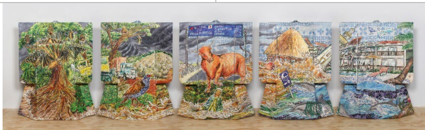
Yuki Kihara, サ - モアのうた (Sāmoa no Uta) A Song About Sāmoa - Fanua (Land) , 2021; Image courtesy: Yuki Kihara and Milford Galleries, Aotearoa New Zealand