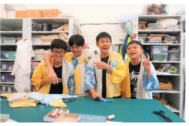
Young Seeders from local schools create their garment with fabrics dyed with self-grown plants.

Since 2019, CHAT has conducted an ongoing community programme titled Seed to Textile. In the 4th year of the programme, CHAT engages local artists, including Makie Chang, Hao Lap Yan Benjamin and Mudwork, to create art with students using locally grown natural resources. Seed to Textile puts into practice artistic models and wholistic ways to live out a sustainable future through engaging members of the community.