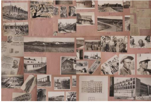
Furqat Palvan-Zadeh, A Dreamland and a River , 2023