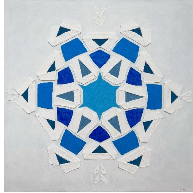
Aziza Shadenova, Mosaic with a star , 2022; Image courtesy: Aziza Shadenova