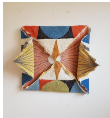
Nazliya Negimova, Metamorphosis , 2022