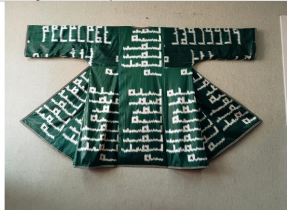
Dilyara Kaipova, Great Cotton Road Project series, 2022; Image courtesy: Dilyara Kaipova