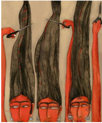
Guzel Zakir, Women. Life. Freedom , 2022