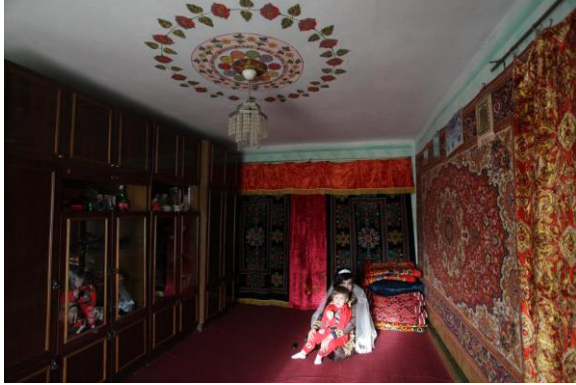
Umida Akhmedova, Farewell to a family house (from the Sun Marks series), 2010-22