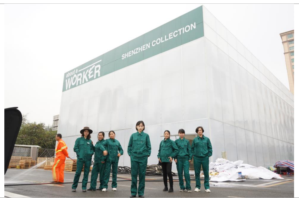
ABOUT A WORKER, ABOUT A WORKER – SHENZHEN, 2020