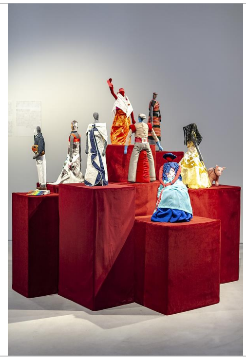
Alma Quinto, Day Off Mo?, 2018-19