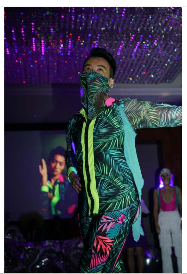
Participants wearing tailor-made outfits by Rebirth Garments at the Access Breach: Radical Visibility event in CHAT's Spring Programme 2021 Interweaving Poetic Code .