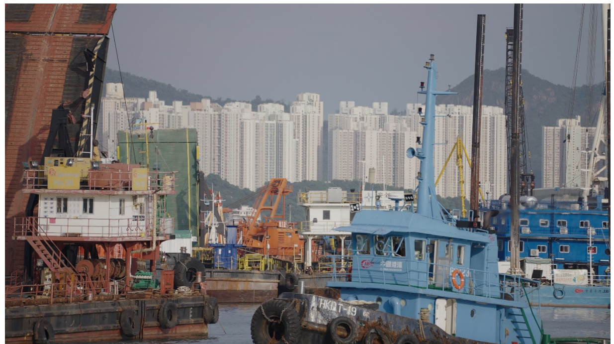
Ho Rui An, Lining, 2021 (Video still); Image courtesy: Ho Rui An

(Hong Kong 9 March, 2022) Following the success of last year's Spinning East Asia Series I: A Compass in Hand exhibition, CHAT (Centre for Heritage, Arts and Textile) presents the second chapter of the series Spinning East Asia Series II: A Net (Dis)entangled on 2 April 2022 (online opening). The exhibition will invite the public to experience the diverse spectrum of history and culture of East Asia through collections of contemporary art produced by 16 prominent artists and artist groups from the East Asia region.