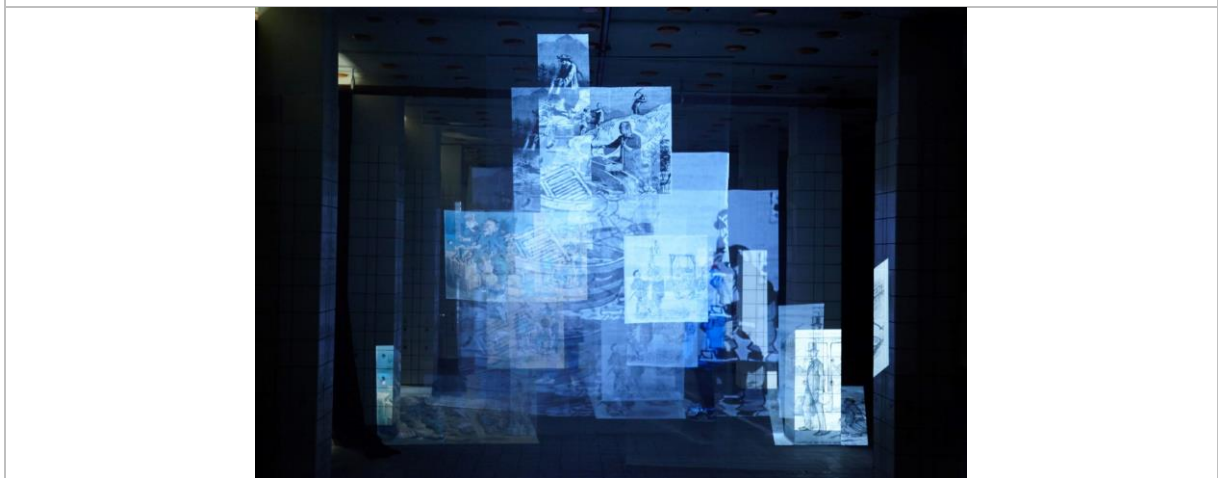
Alice Wong, US & THEM , 2019