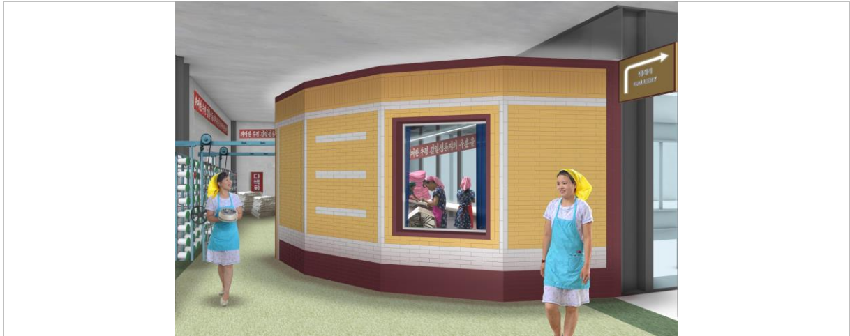
Spatial Anatomy's design concept of Myeon-bang , 2021