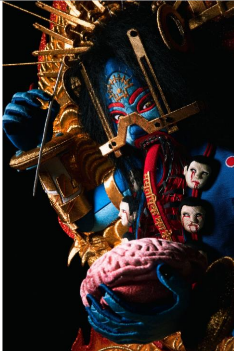
Lu Yang and Takahashi Naotaka, Electromagnetic Brainology – Fire Deity , 2021