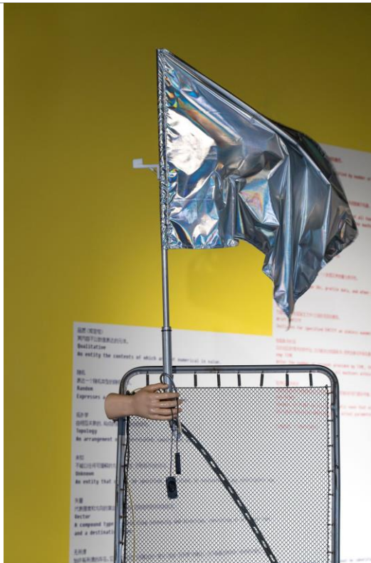
Guo Cheng, Wind Verification , 2021