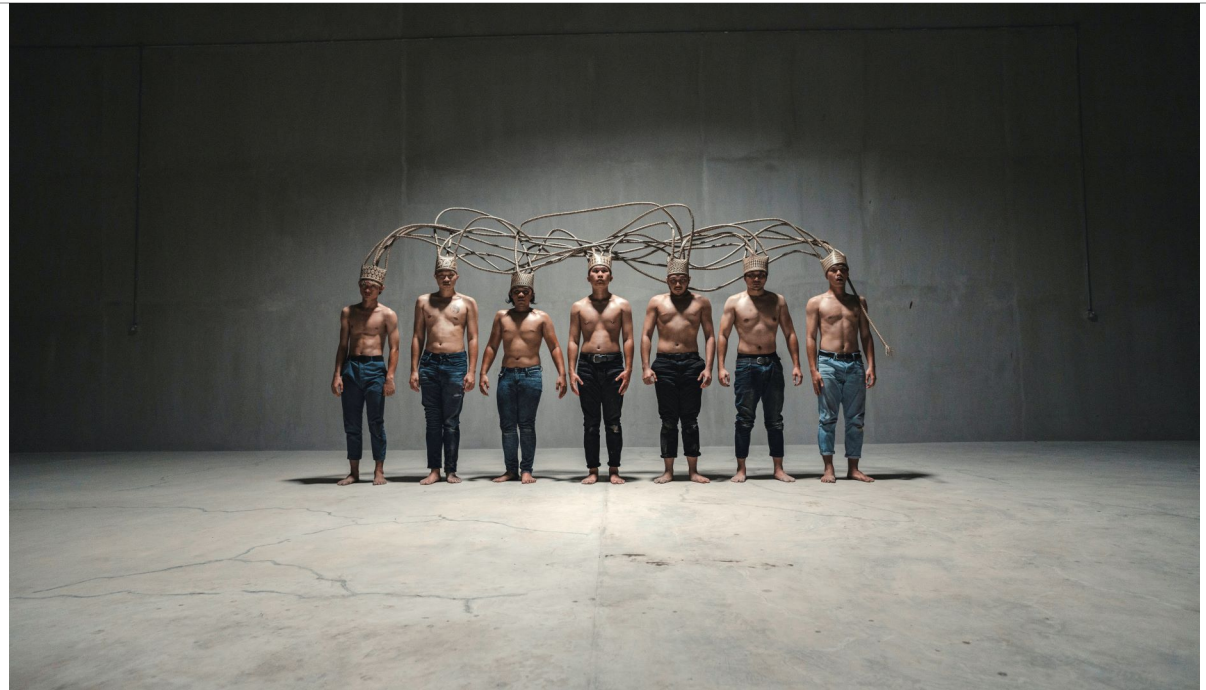
Yee I-Lann, with weaving by Lili Naming, Siat Yanau, Shahrizan Bin Juin; choreography & dancers: Tagaps Dance Theatre; cinematography: Huntwo Studios, PANGKIS , 2021 (Video still)