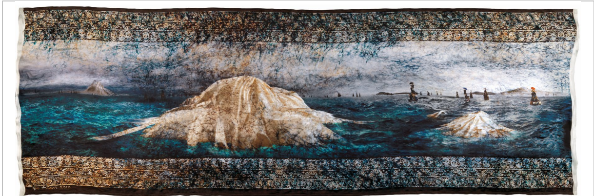
Yee I-Lann, The Orang Besar Series: Empires of Privateers and Their Glorious Ventures , 2010