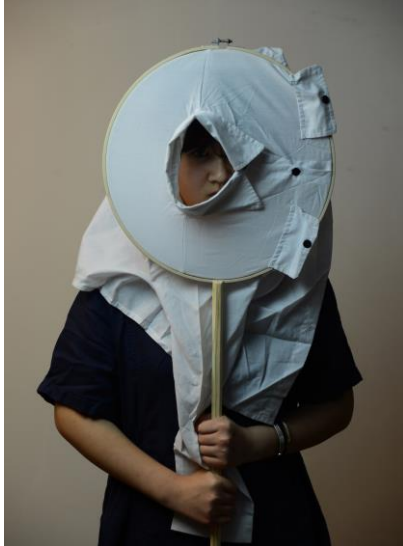
Yin Xiuzhen, Round Fan , 2019