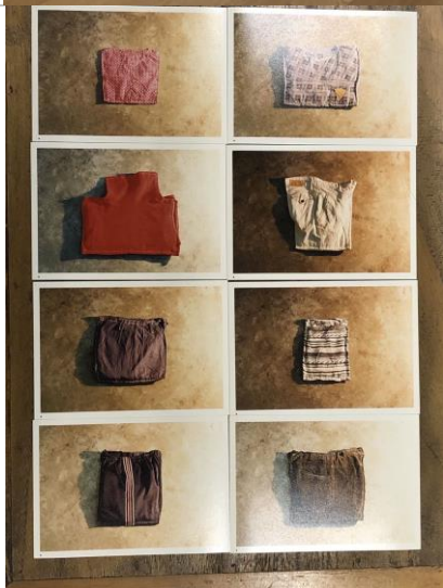
Yin Xiuzhen, Dress Box photo series , 1995 (Detail)