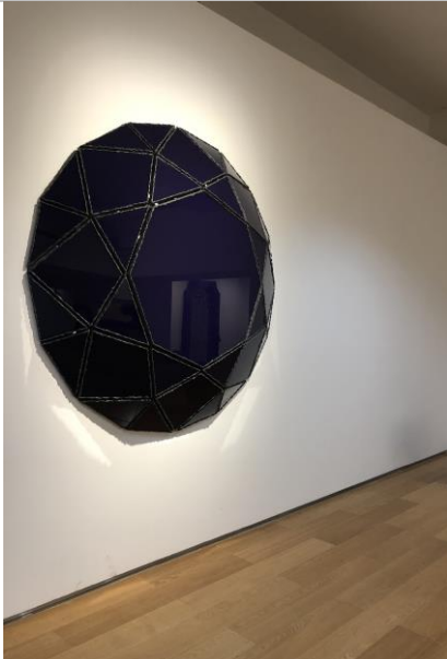
Yin Xiuzhen, Black Hole No. 4 , 2019