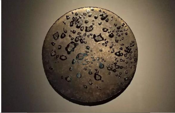
Yin Xiuzhen, Microcosm , 2016 Courtesy of the artist