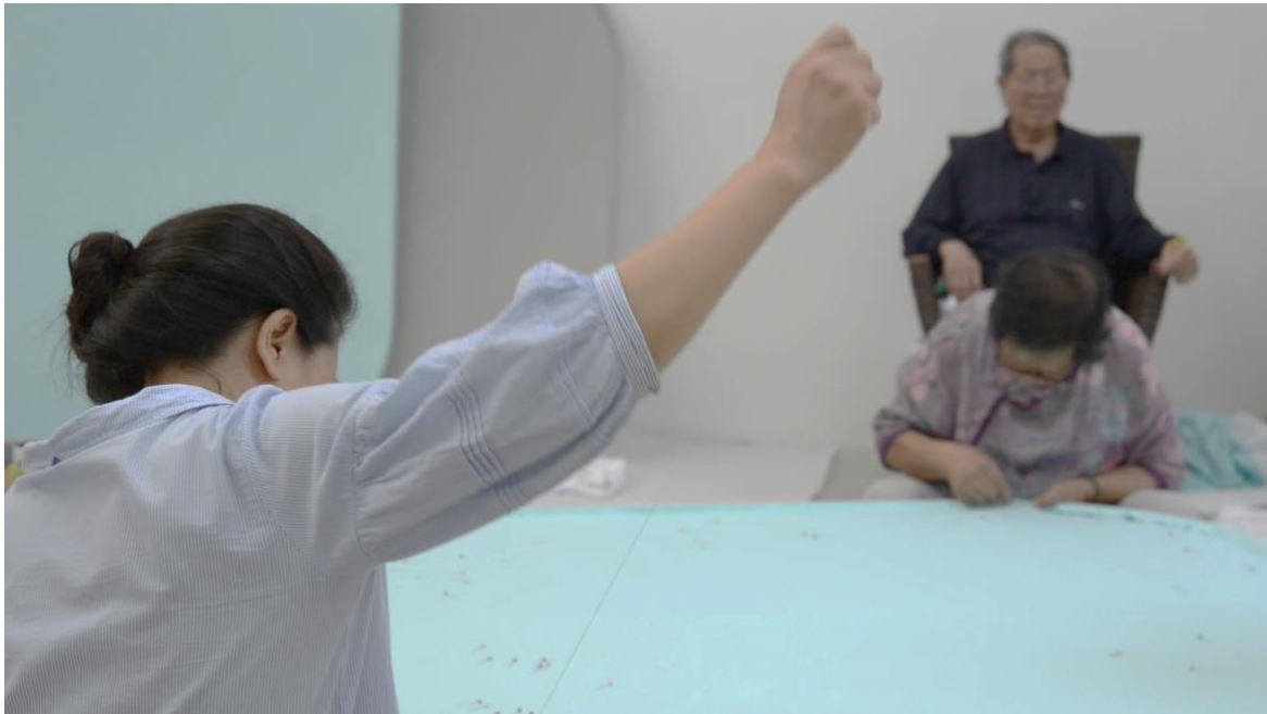
Yin Xiuzhen, Sky Patch , 2020 (Video still)

Leading figure in Chinese contemporary arts joins forces with CHAT for her first large-scale exhibition in a museum setting in Hong Kong