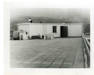
Old Photo (Mill 1 Rooftop of Nan Fung Textiles Limited), 1955