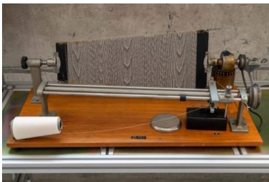
Winding Board (Nan Fung Textiles Limited), 1997, Collection of CHAT, Hong Kong