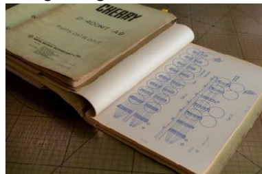
'Cherry' Drawing Frame Manuals (Cherry D-400MT, Japan, Made by Hara Shokki Seisakusho), 1986, Collection of CHAT, Hong Kong