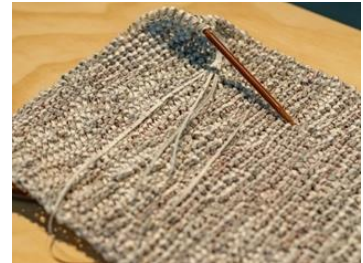
Movana Chen, Fabric of CHAT , 2019 Collection of CHAT, Hong Kong