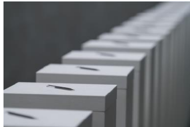
Morgan Wong, Time Needle Series , 2016 – ongoing Collection of CHAT, Hong Kong