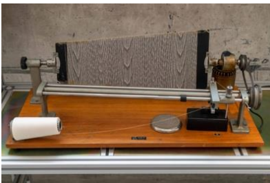
Winding Board (Nan Fung Textiles Limited), 1997, Collection of CHAT, Hong Kong