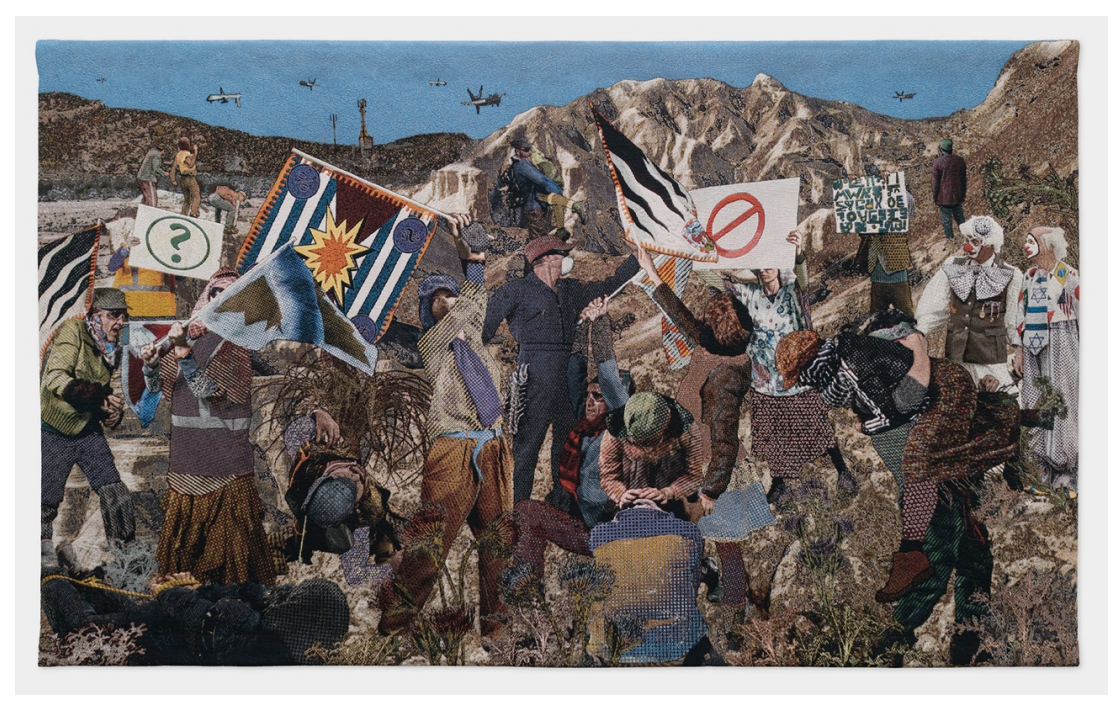
Aziz + Cucher, Aporia , 2016, Cotton and wool Jacquard weaving © Aziz + Cucher / Commissioned by MILL6 Foundation

HONG KONG - 24 January 2017 - MILL6 Foundation proudly announces its Spring exhibition, Line of Times , featuring Brooklyn-based artist-duo Aziz + Cucher , Taiwan artist Yin-Ju Chen and Hong Kong artist Morgan Wong . Presenting a series of tapestries, sculpture, installation, and video works, the exhibition intends to interweave the macro- and micro-perspectives of viewing the concept of time. Reflecting the multi-dimensional nature of contemporary society, the artists' representations spanning on the metaphysical and physical environment are centered. The exhibition will run from 11 March to 2 April at the MILL6 Pop-up Space at The Annex.